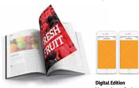
Digital Edition Your advert displays as two consecutive full-page adverts

TWIO PAGES OF ADVERTISEMENT FRONT AND REVERSE, PRINTED ON THICKER PAPER